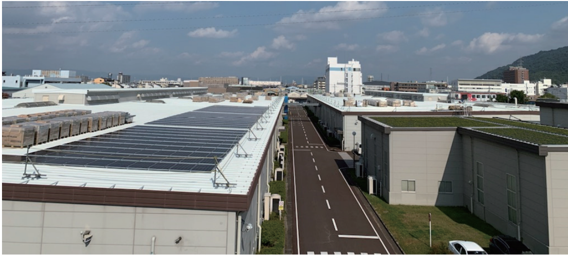
Image of the in-house power generation equipment installed to date