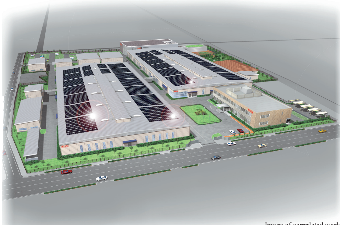
Image of completed work

Nikken Kosakusho Works, Ltd. ( “Nikken” or “the Company” ) announces its decision to introduce a large-scale (capacity greater than 1 MW) in-house solar power generation facility on the 55,000-m 2 property of its head office and factory in the city of Daito, Osaka, in a joint project with Kansai Electric Power Co., Inc. ( “Kansai Electric Power” ) aiming to promote efforts to reduce greenhouse gas emissions toward the realization of a decarbonized society.